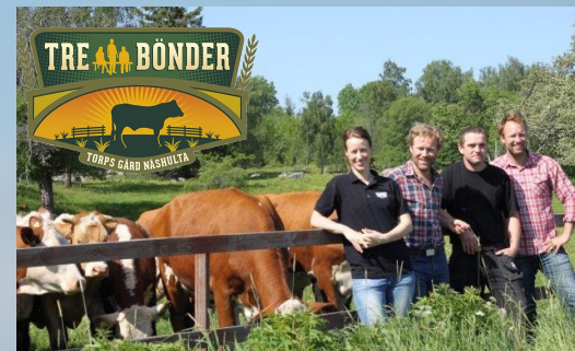
Local beef from the forests of Sweden